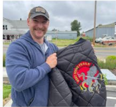
WESTSOUND F.O.O.L.S. & BEER CRAWL