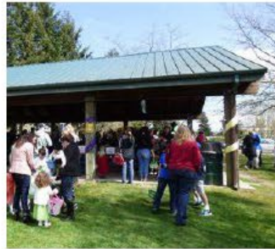
GRADUATION AT THE PARK