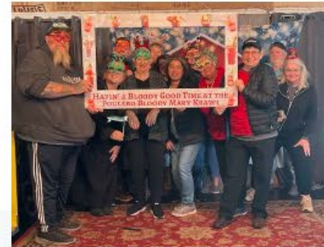
POULSBO BLOODY MARY KRAWL