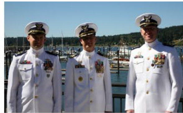
NEB BLUE CHANGE OF COMMAND CEREMONY