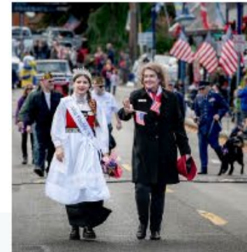
VETERANS DAY PARADE & CELEBRATION