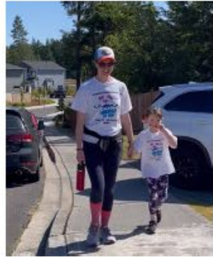
FINS TO FINISH