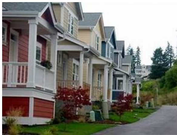
Poulsbo cottage homes